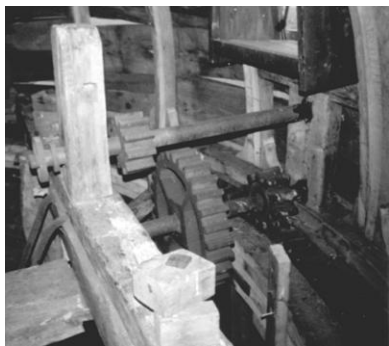
Bonnet gears restored, 1968