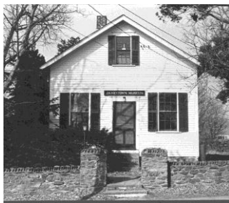
Jamestown Museum, 1973

In 1885, the town built a one-room schoolhouse on Southwest Avenue for the primary grades. When the Carr School opened in 1898 to house all grades, the building was moved to 92 Narragansett Avenue to house the Jamestown Philomenian Library. The entryways were changed, shelves were built in, and in 1921 a small room was added to the back of the original structure.