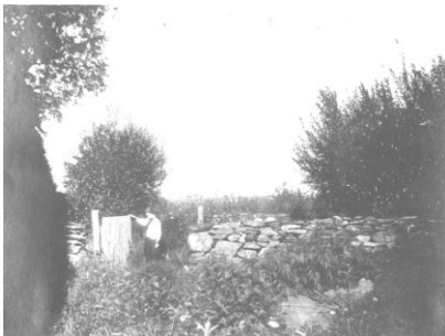
Town Pound in Clarke album, 1920

Objects continue to be added to the collection. By 2012, 1,500 objects had been catalogued and most of them had been photographed.