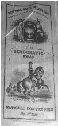
Harrison convention ribbon, 1840