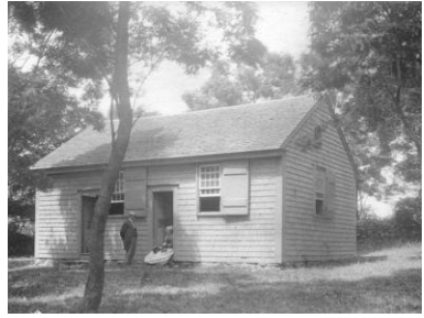
Quaker Meetinghouse, 1890