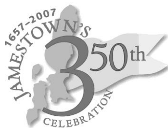
Jamestown 350 logo

Hall in 2007 and was celebrated with Jamestown 350 Week. The Society sponsored a historic walking tour of Narragansett Avenue, co-sponsored a scavenger hunt through Jamestown's history, and again posted a time line of Jamestown history.