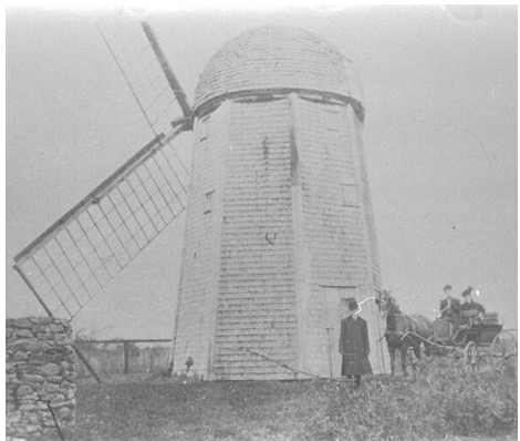
Jamestown Windmill, 1906

For seven years, the mill stood neglected. Equipment was removed or destroyed, and weather took its toll. In 1904, the mill's pitiful condition led residents and summer visitors to form the Jamestown Windmill Association. The association circulated a petition (opposite page) to raise money to buy the derelict building.