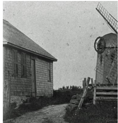
Miller’s cottage, 1889

When membership was opened to “all persons interested in the objects of the Society,” the requirement that application for membership “be made in writing to the Secretary of the Society who will present the names of applicants [to] the Executive Board” remained. This provision was finally dropped in 1979.