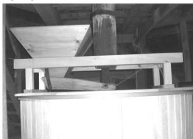
Vat, hopper, and shoe furniture installed in July 2012

A Rhode Island Council for Humanities grant helped pay for the exterior signage installed in 2012. A second RICH grant was awarded to improve the interior signage and displays. Incremental improvements continue to be made to enhance visitors’ enjoyment and understanding of the site.