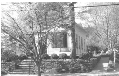
Jamestown Museum, 2010

A Capital Campaign conducted in 2006-2008 had three major aims: renovate the museum to provide the needed environmental controls, build an environmentally controlled vault in which to store the more fragile and valuable