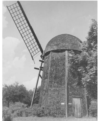
After Hurricane Carol, 1954

A $1,500 grant from the Rhode Island Foundation in 1957 allowed the arms to be restored in time for that year's tercentenary of the purchase of the island. But the funds did not cover repairs needed to the bonnet, and the arms were fixed facing southwest.