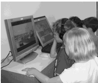
Students from the Melrose Avenue School watch videos during the 2011 museum exhibit: Jamestown on Stage and Screen

Watson also wrote an historical sketch of Jamestown for the 1957 celebration of the 300 th anniversary of the purchase of the island. For the 300 th anniversary of the town in 1978, the Society mounted an exhibit covering the whole 300 years, and for the 325 th in 2003 created a time line of Jamestown history, which was included in the program. Selected highlights from the time line were displayed along Narragansett Avenue from Four Corners to East Ferry.