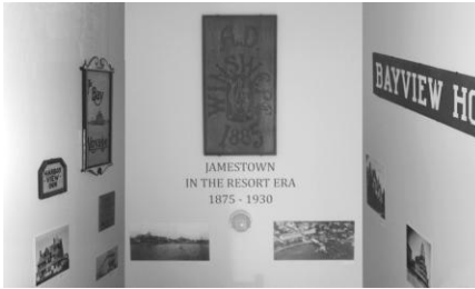
Signs from Jamestown's resort era in the Town Hall stairwell, 2012

formed into a "Ferry Room," allowing a larger permanent display of objects related to the ferries that served the island until 1969.