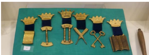
The insignia of office of the Royal Arcanum, which was active here through the 1950s.

Each school year there are two exhibits at the Lawn Avenue School, one in the fall when school begins and a second after the holiday vacation. Keeping House , the fall exhibit, was replaced in January with