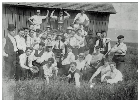
New to the collection: 1906 photograph of games at Carr's Grove.

The following pages list all donations received from November 2014 through April 2015.