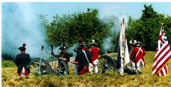
Newport Artillery at Battery Day, 2002.

Although we did not try to continue the military theme into the house tour, two of the houses on the tour were built by retired U.S. Navy officers. In the late 19 th and early 20 th centuries, many navy men retired to Jamestown. In fact, Maud Howe Elliot reported in This Was My Newport (1944), "It is said that if, on Conanicut Island, you closed your eyes and threw a stone you would probably hit a retired Rear Admiral."