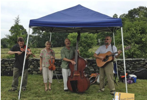
Windmill Day 2014.