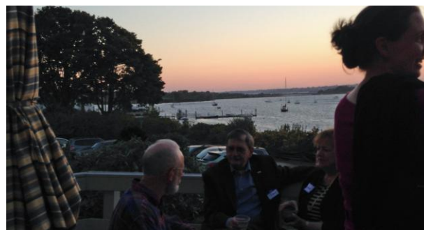
The Volunteer Appreciation Party

Note: There is always a danger in assembling a list of this sort that someone who has worked hard is unintentionally omitted. Please call 423-2674 or email us at info@jamestownhistoricalsociety.org to let us know.