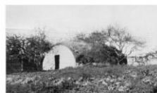
Root Cellar. Root cellars are built underground where the temperature and humidity are stable or, like this one at Jamestown’s Maplewood, partially above ground and covered with sod for insulation. Vegetables such as potatoes and turnips and fruits such as apples were stored this way to keep them from freezing when it got cold and cool when it got hot.