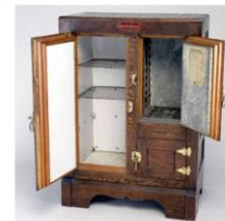
Ice Box. A large block of ice lay in the compartment near the top of the box. Cold air circulated down and around the storage areas. Few blocks of ice were needed often. In Jamestown, ice was cut from ponds – including the Clarke Pond on Southwest Avenue – and wrapped in straw for delivery later.

The fall exhibit at the Lawn Avenue School follows the changes in household tools across Jamestown’s history.