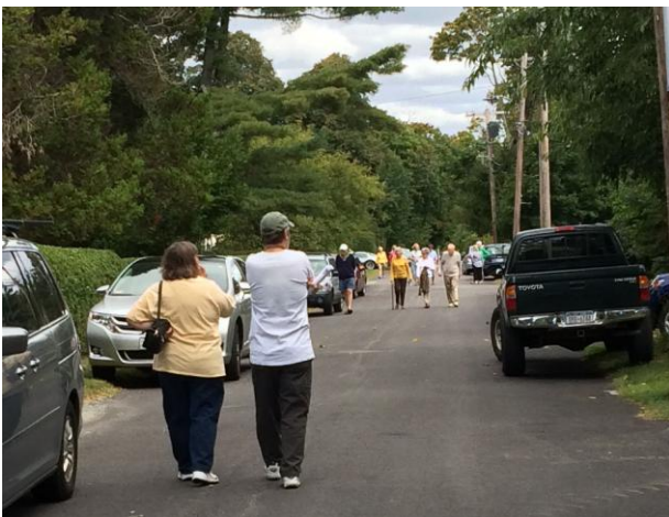
Visitors walked up and down Green Lane between the houses, most of them built in the 1880s, that were on this year's house tour.