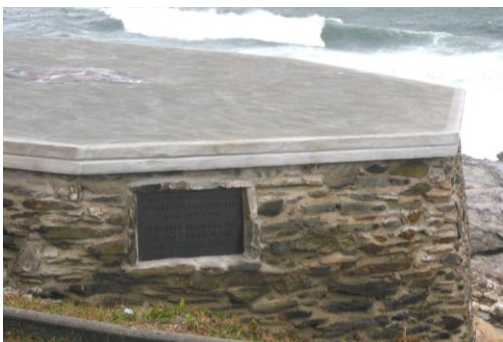
Slate tablet at Beavertail.