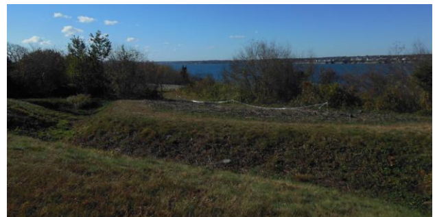
View corridor at the Conanicut Battery

The trimming on the trails continues. An overlook on the new Northern Loop trail now gives a view up the bay to Dutch Island and the Jamestown Verrazzano Bridge.