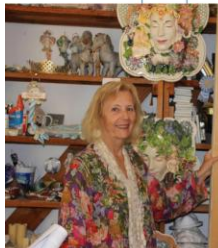
King-Sherman house, 1873