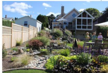
King-Pimentel house, 1895