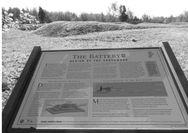
Signs telling visitors about the 1776 battery in the town's Battery Park were replaced this summer.