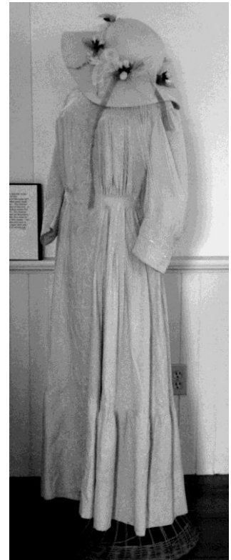
Late 19 th century day dress and hat in summer exhibit.

For the first time, the JHS online catalog was available from a terminal in the museum. The Society's library was relocated to the main room to provide better access for visitors.