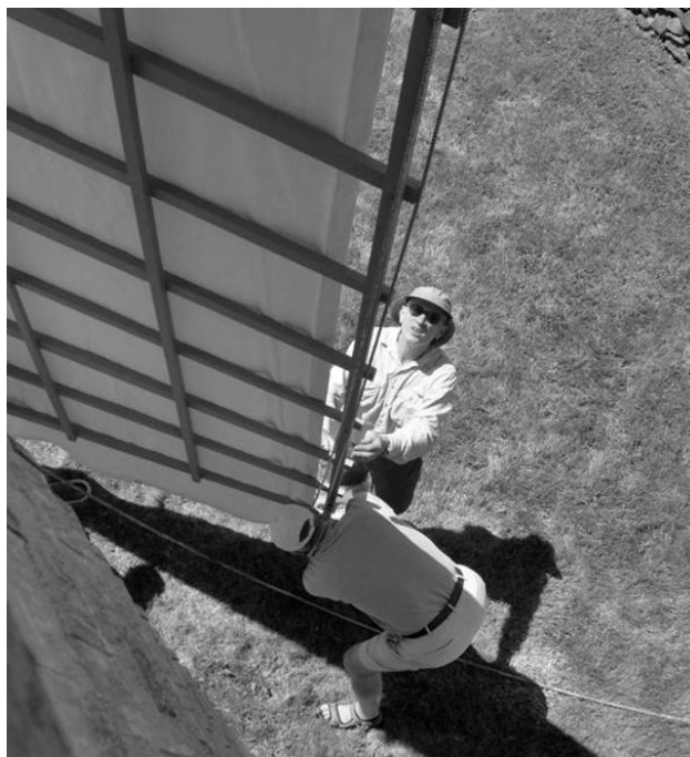
JHS volunteers help to raise the windmill sails, Windmill Day 2010.