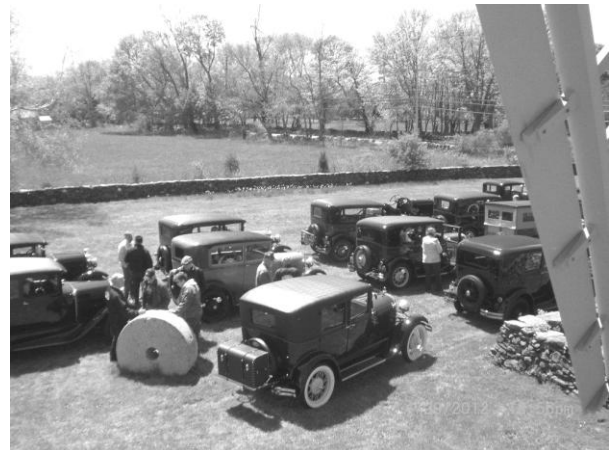
Seventeen Model A Fords from the Little Rhody Model A Club visited the windmill on April 29.

We are very excited about the upcoming Windmill Day that will be held on July 14, 2012. A lot of planning has gone into this event that we hope will be a fun-filled celebration of the Society’s 100 th anniversary. Details can be found on the front page of this newsletter. Please plan to join us!