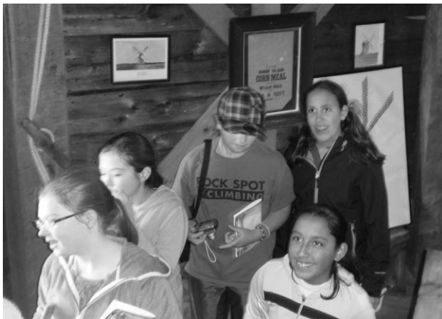
Lawn Avenue fifth grade students visited the Jamestown windmill and the Friends Meetinghouse in April.

Grand opening for the summer exhibit, 1912 and the JHS Centennial . Museum hours: 1 to 4 PM, Wednesdays to Sundays through Labor Day and Saturday and Sunday through October 10.