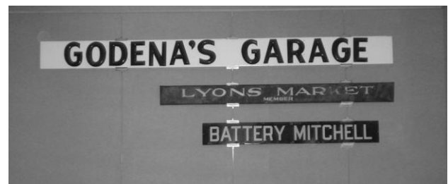
The recently donated Godena's Garage sign is on display in the library meeting room with other signs from the JHS collections.

Wonderful donations continue to arrive and some can already be seen in JHS exhibits. All donations this winter and spring are listed on the next page.