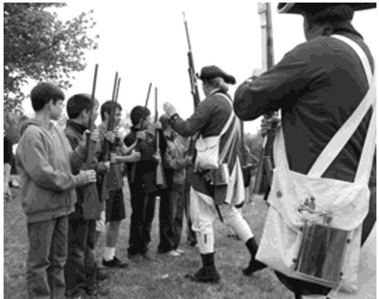
British reenactors drilling youngsters at Battery Day