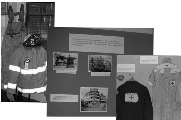
This year's museum exhibit featured the history of Jamestown's volunteer fire and rescue groups.