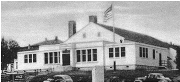
The Community Center in 1946

Our first program this year will be something new and different for the Jamestown Historical Society. To honor the Community Center and the many decades of service it has given to the island, the Historical Society is proud to present a vintage fashion show.