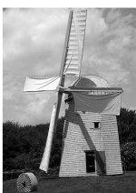
North Main Road Jamestown, Rhode Island

Owned and maintained by Jamestown Historical Society Jamestown, Rhode Island