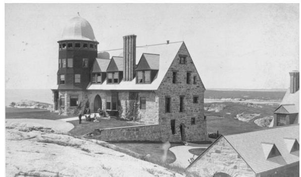
The Wright Collection

This historic site of over 20 acres should be exciting for one and all. The price is a $15 per person and can be paid at the entrance on the day of the tour.