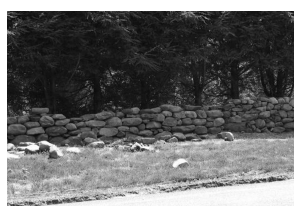
A stone wall at the meetinghouse, damaged in a winter accident, has since been repaired.

side, which should make storage and access to the museum's collection much easier.