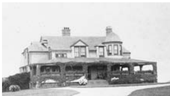
The Boulders in 1890. An early picture of one of the houses visited on the house tour.