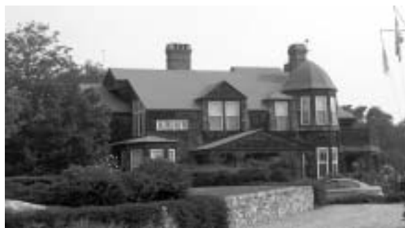
The Boulders today.