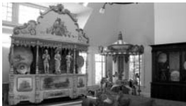
The carousel and one of the musical automatons housed in the modern addition at Channel Bells .

The Boulders retains a summer cottage feel that speaks clearly of its roots in the Jamestown vacation community. Eglesfeld , the oldest of the houses, shows how delightfully the old can be blended with comforts of modern life. At Channel Bells , the owners entertained the tour guests with music from their extensive collection of 19 th and early 20 th century musical devices.