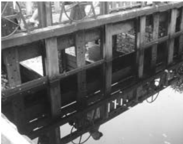
The millpond above the sluices for the water wheels that power the Saunderstown mills reflected an almost cloudless sky.

Then our group of more than 20 – followed by some hangers-on in their own cars – boarded the motor