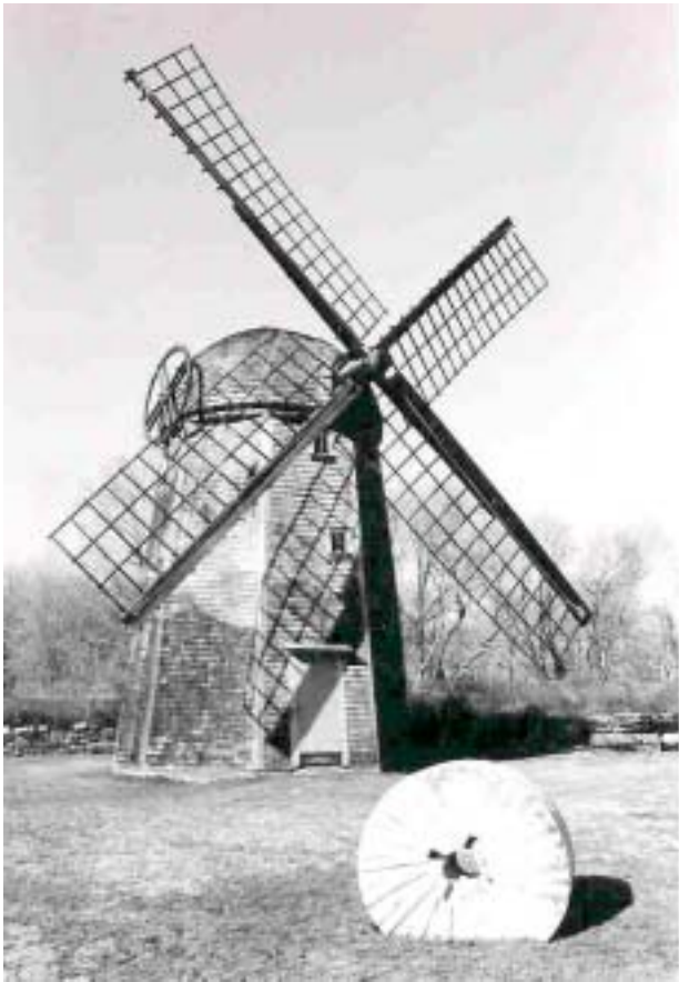
The Jamestown Windmill is the first stop on the June Mill Tour.