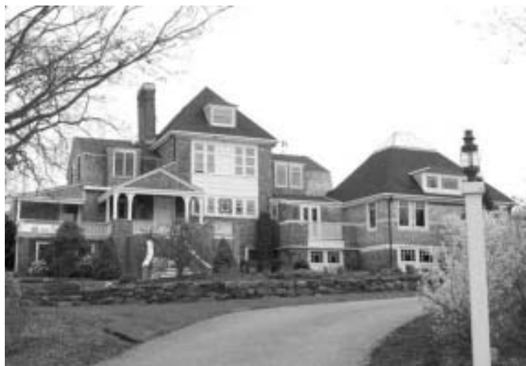
Channel Bells sits on a Dumpling high above Fort Wetherill.