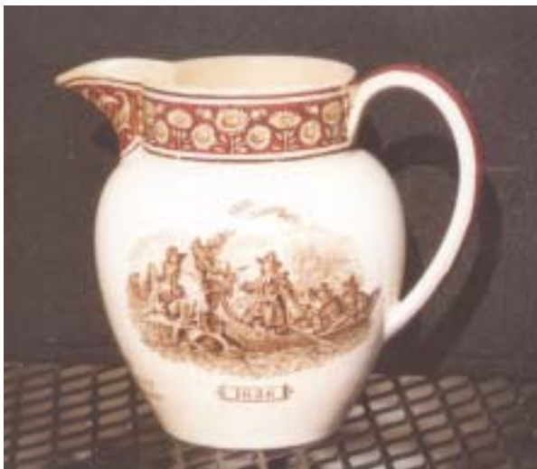
This Wedgwood pitcher commemorates Roger Williams's settling in Providence.

A recent acquisition in the Jamestown Museum's collection is the Wedgwood pitcher pictured here. The reverse side of the pitcher commemorates Roger Williams's settling in Rhode Island with the